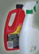
Narrow Neck Containers