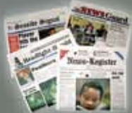
Newspaper, including inserts (remove plastic sleeves)