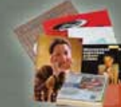
Magazines, Catalogs & Telephone Books