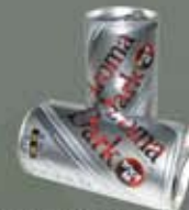
Aluminum Cans, Trays & Foil