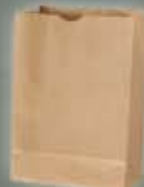
Kraft (brown paper) Bags