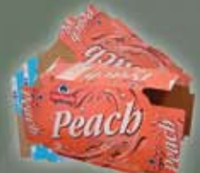
Carrier Stock (soda & beer can carrying cases)