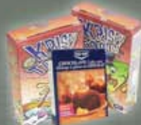
Chipboard (cereal, cake & food mix boxes, gift boxes, etc.)