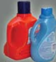
Detergent and Fabric Softener Containers