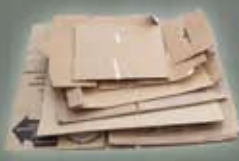
Cardboard (no waxed cardboard)