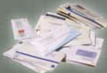
Junk Mail & Envelopes