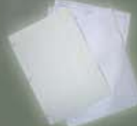
Office, Computer, Notebook & Gift Wrap Paper