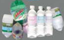
Soda, Water & Flavored Beverage Bottles