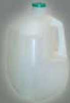
Milk and Juice Jugs