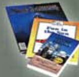
Paper Back Books (no hard cover books)