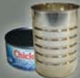
Steel Cans and Tins